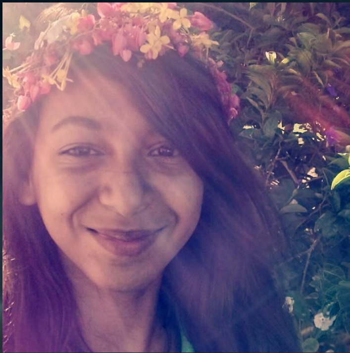
Front cover a (Original Image)