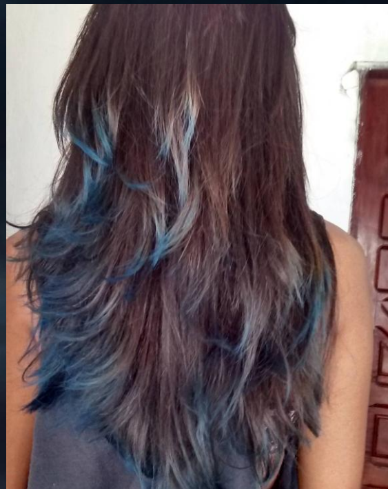
Front cover b (Original Image)